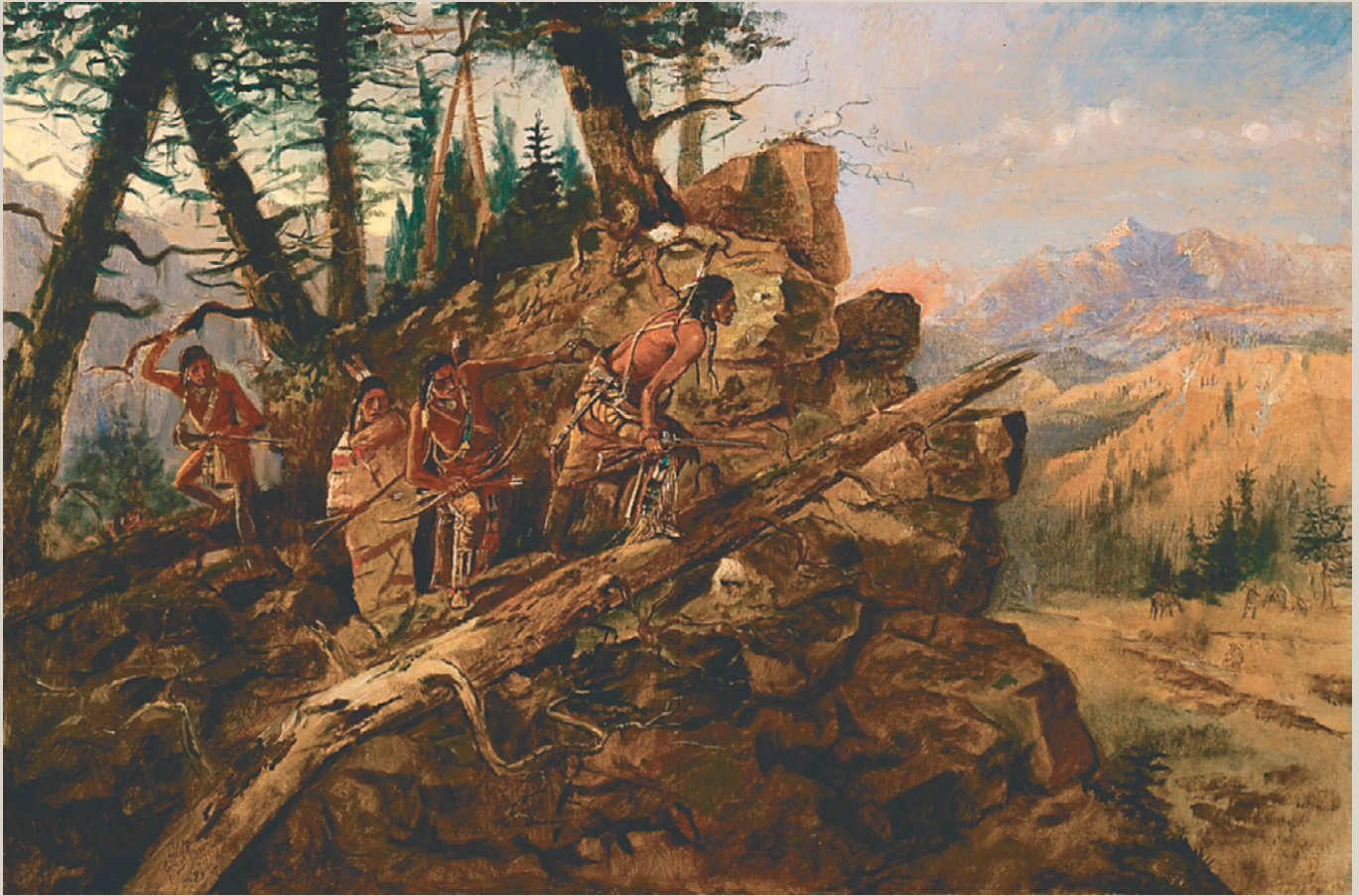
Plunder on the Horizon , by Charles M. Russell, 1893, Oil on Canvas Sid Richardson Museum, Fort Worth, Texas