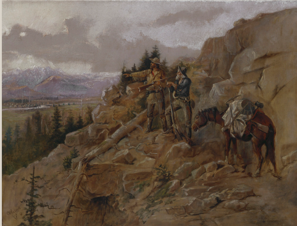
Trouble on the Horizon , by Charles M. Russell, 1893, Oil on Canvas Sid Richardson Museum, Fort Worth, Texas