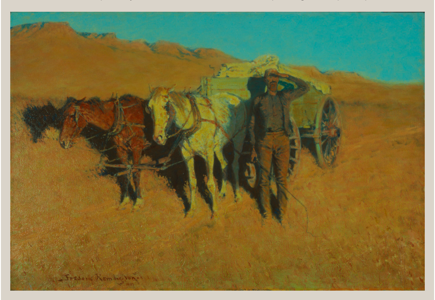
The Dry Camp , Frederic Remington, 1907, Oil on Canvas Sid Richardson Museum, Fort Worth, Texas

o Create a transparency of the Sid Richardson Museum painting The Dry Camp .