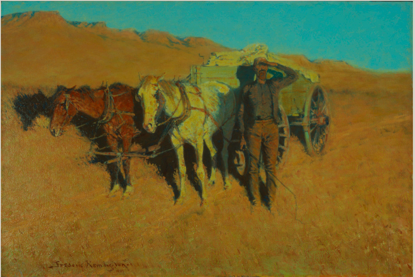
The Dry Camp , Frederic Remington, 1907, Oil on Canvas Sid Richardson Museum, Fort Worth, Texas